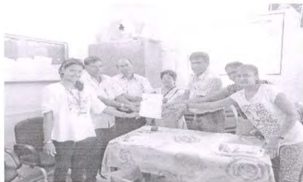
Members of BMC