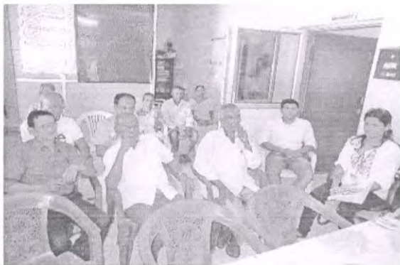
Villagers present for the function